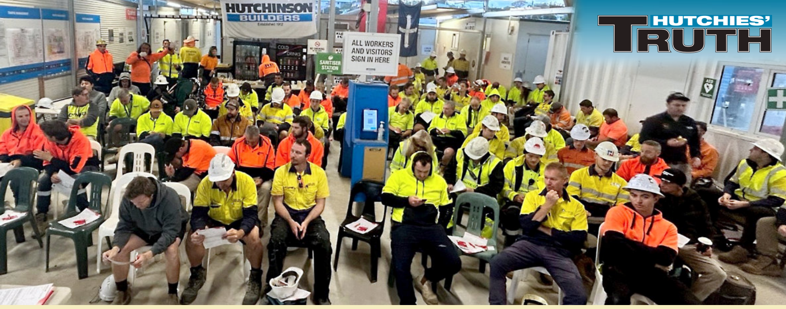
Team support for Mates in Construction training day.

HUTCHIES, an advocate of mental health awareness and a strong supporter of Mates in Construction, recently held a Mates in Construction general awareness training day at Yeerongpilly Green retail precinct, with the entire site participating.