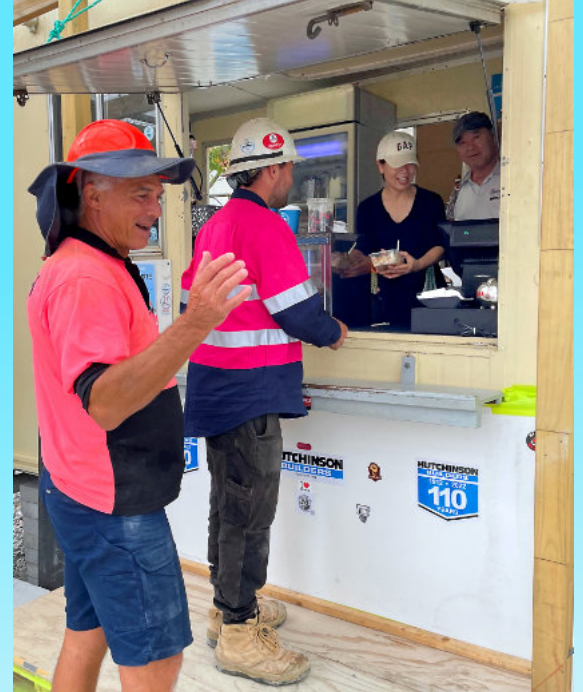
A couple of the boys from Heinrich enjoy the new shelter at Hutchies' canteen.