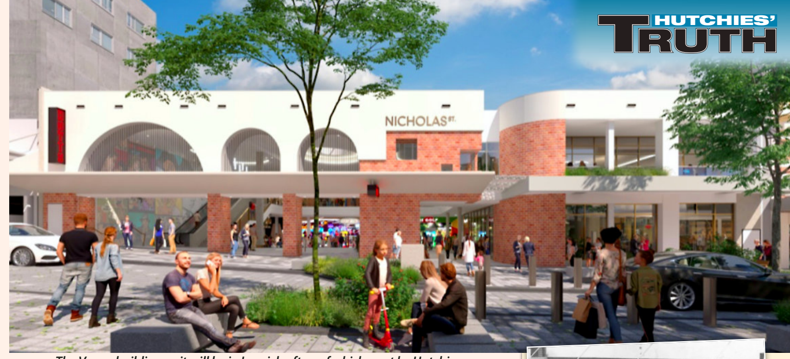
The Venue building as it will be in Ipswich after refurbishment by Hutchies.