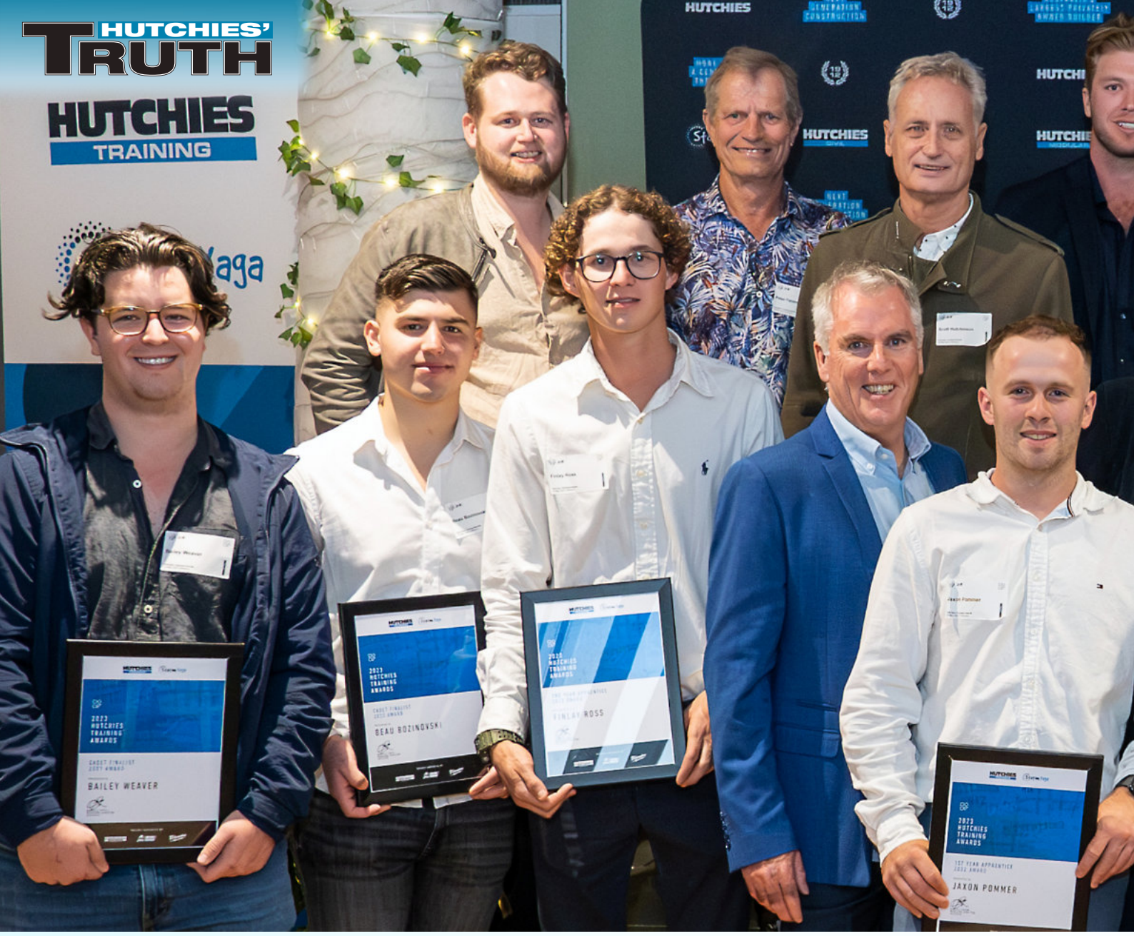
Apprentices and cadets joined sponsors an

THE excellence of Hutchies' training programs for cadets and apprentices was highlighted with the 2023 Hutchies Training Awards held in May.