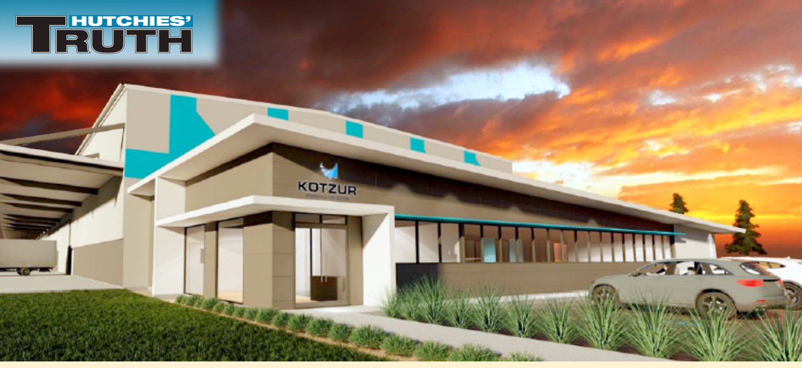
Image of Kotzur's new manufacturing plant under construction at Charlton outside Toowoomba.

HUTCHIES has started construction of a $20 million manufacturing plant for Australian bulk solids storage and handling company, Kotzur, at Charlton outside Toowoomba.